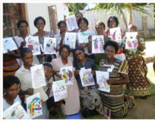
Mozambique Union Mission – CHM Workshop 'Helpers for Jesus' was the theme for a Children's Ministries Workshop, the 1st ever taking place in the old Liberdade Church, Maputo on March 21 & 22. It was hosted

Sabbath meetings were held at the campground of the Union with over 5,000 people. Children's choirs from the churches throughout the island travelled to this event. The children ran the entire Sabbath School, giving mission story, drama, offerings; summarizing the adult Sabbath School lesson, etc. One highlight on Sabbath afternoon was the commitment service for 70 children. Children, ages 6-14, took a stand to accept Jesus as their "Forever Friend", and each was supported by his/her spiritual friend. After the dedication prayer, the pastors of these districts stood to affirm the children's decision and promise to support them and welcome them. It was heartwarming!